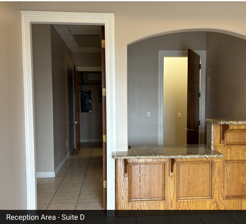
Reception Area - Suite D