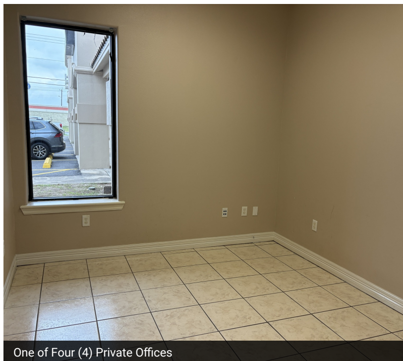
One of Four (4) Private Offices