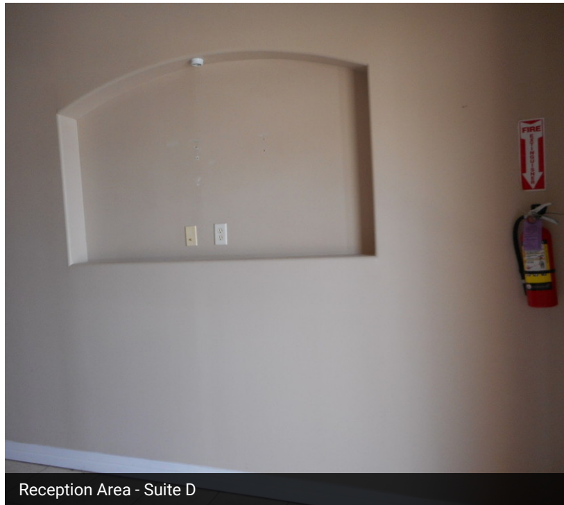
Reception Area - Suite D