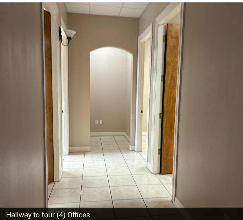
Hallway to four (4) Offices