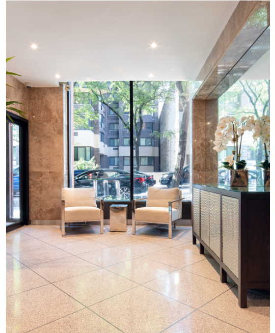
Entrance - Ground Floor/Street view