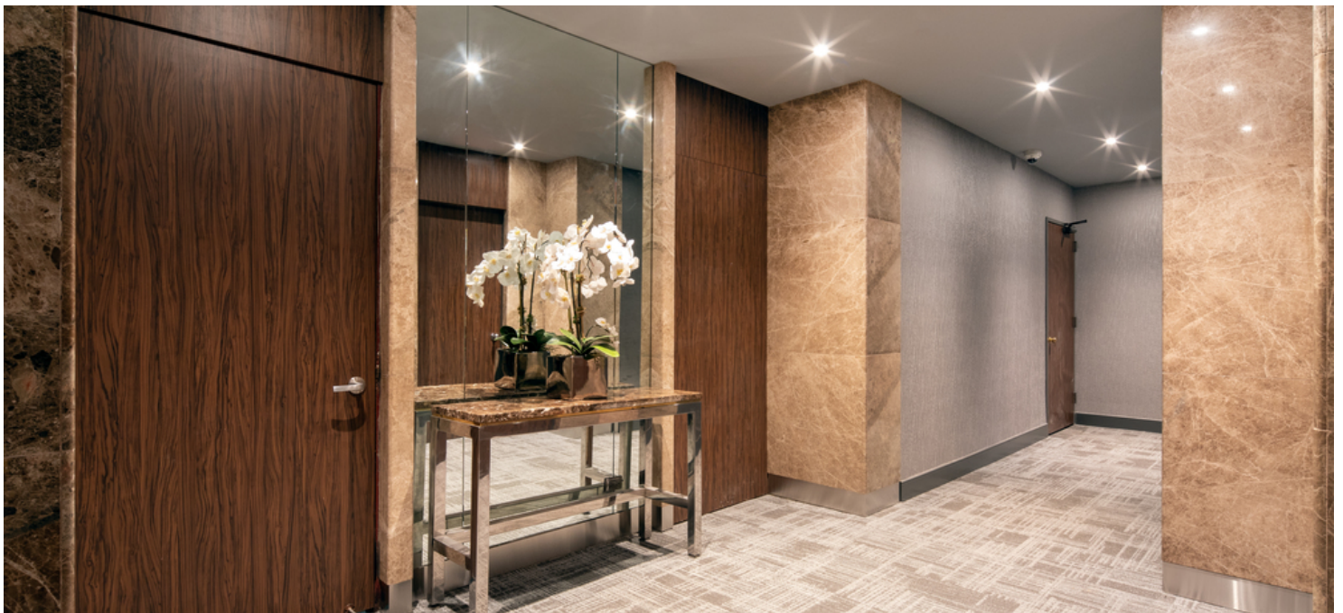
2nd Floor - Medical Space

KW COMMERCIAL 1155 Avenue of the Americas New York, NY 10036