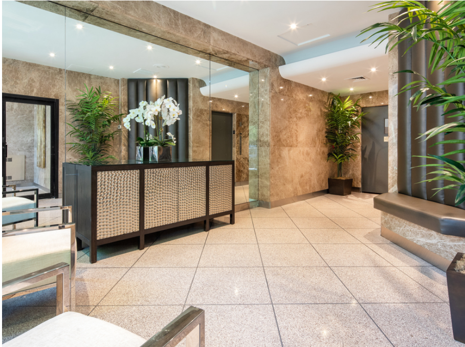
Entrance - Ground Floor