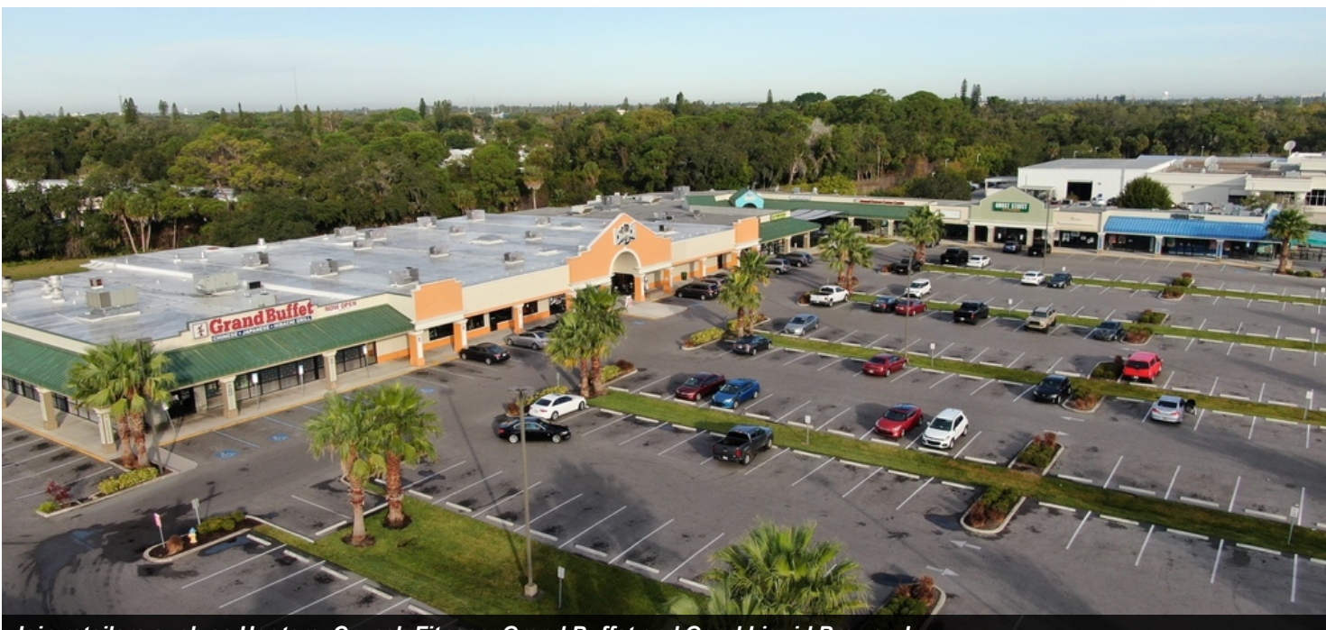
Join retailers such as Hooters, Crunch Fitness, Grand Buffet and Good Liquid Brewery!

4808-4848 14th St W, Bradenton, FL 34207