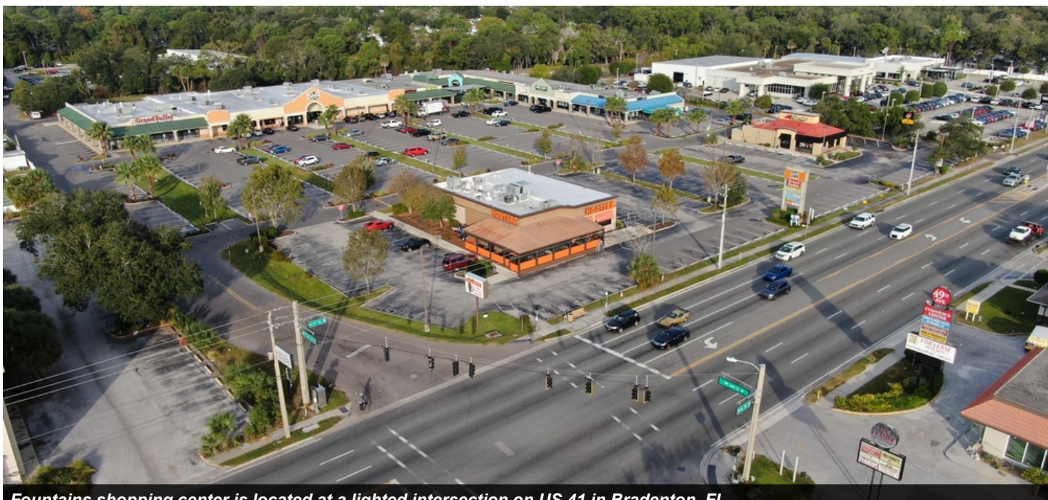
Fountains shopping center is located at a lighted intersection on US 41 in Bradenton, FL

Presented By: 941.928.1243 nick@ian-black.com