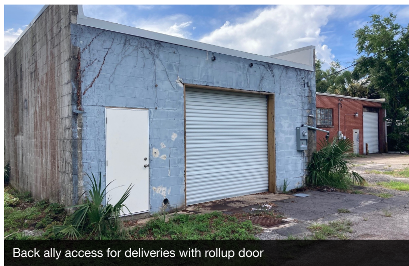
Back ally access for deliveries with rollup door