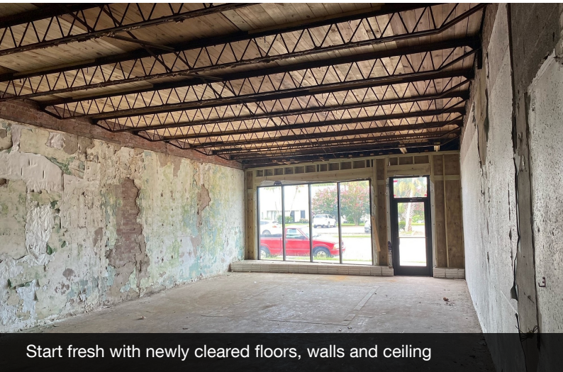
Start fresh with newly cleared floors, walls and ceiling