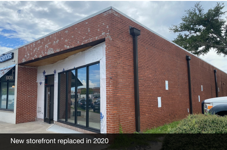
New storefront replaced in 2020