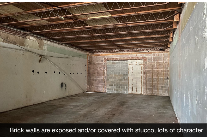
Brick walls are exposed and/or covered with stucco, lots of character