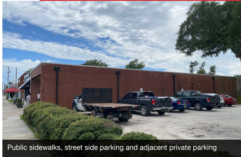
Public sidewalks, street side parking and adjacent private parking