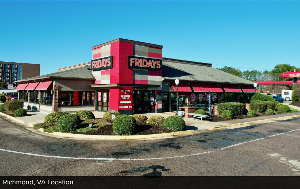
Richmond, VA Location