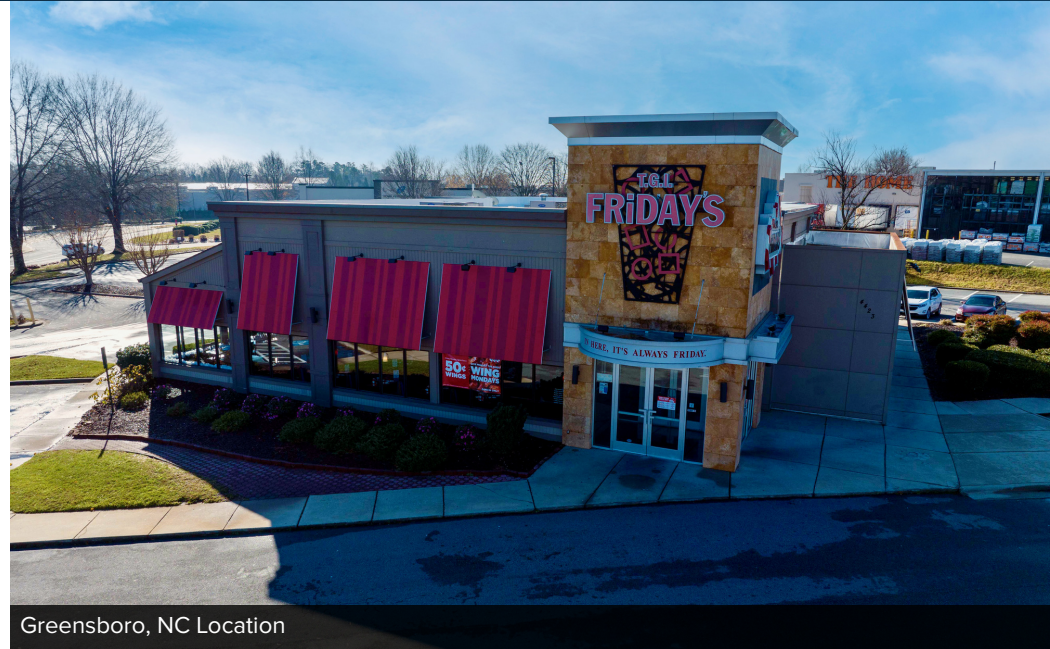
Greensboro, NC Location