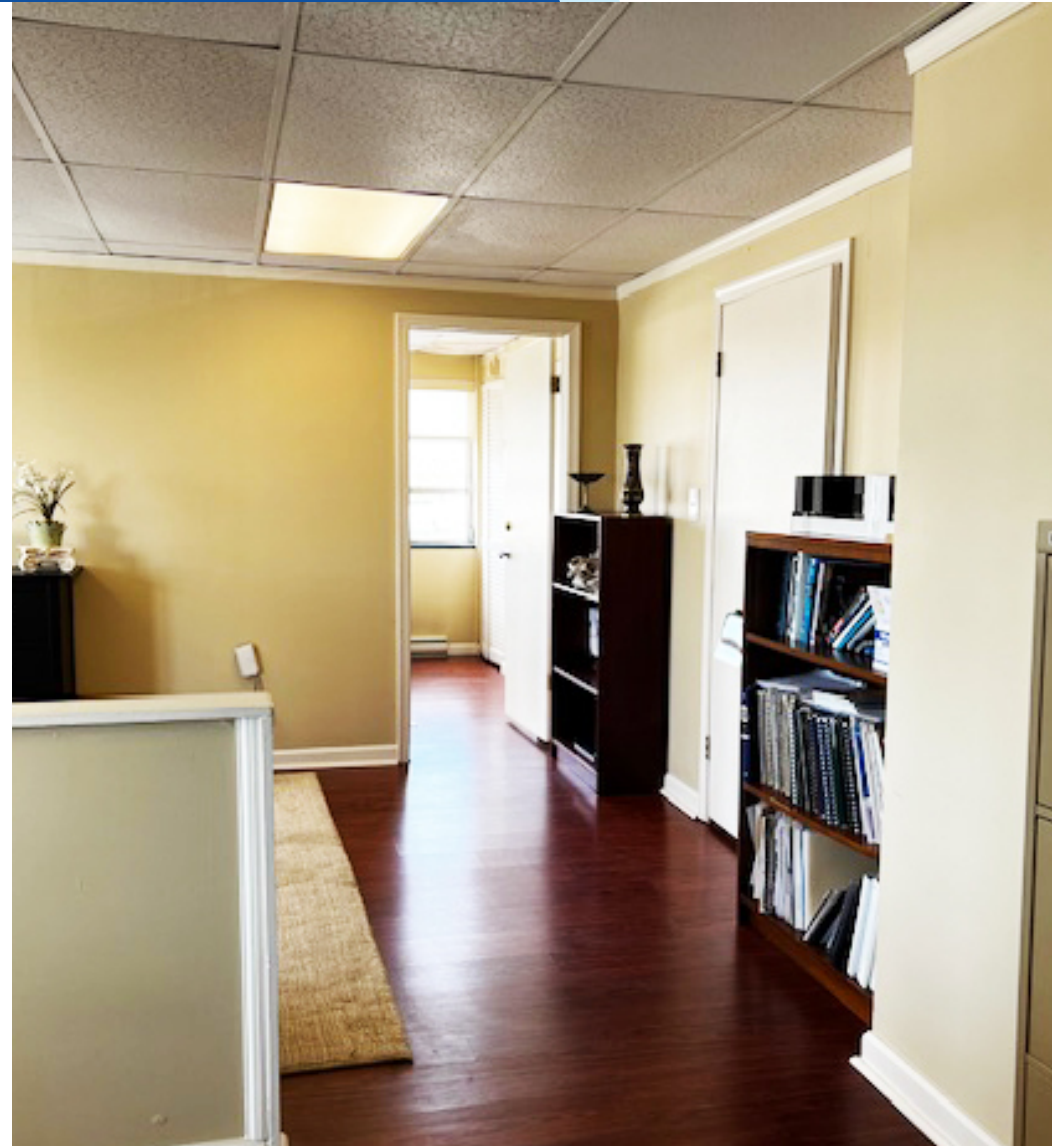
4rd Floor Entrance

TYLER FORESTA Sales & Leasing O: 302.414.1000 | C: 302.584.8615 tforesta@LMTCRE.com