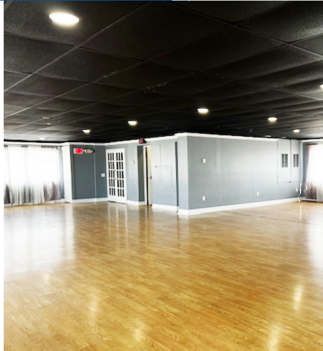
3rd Floor Dance Studio