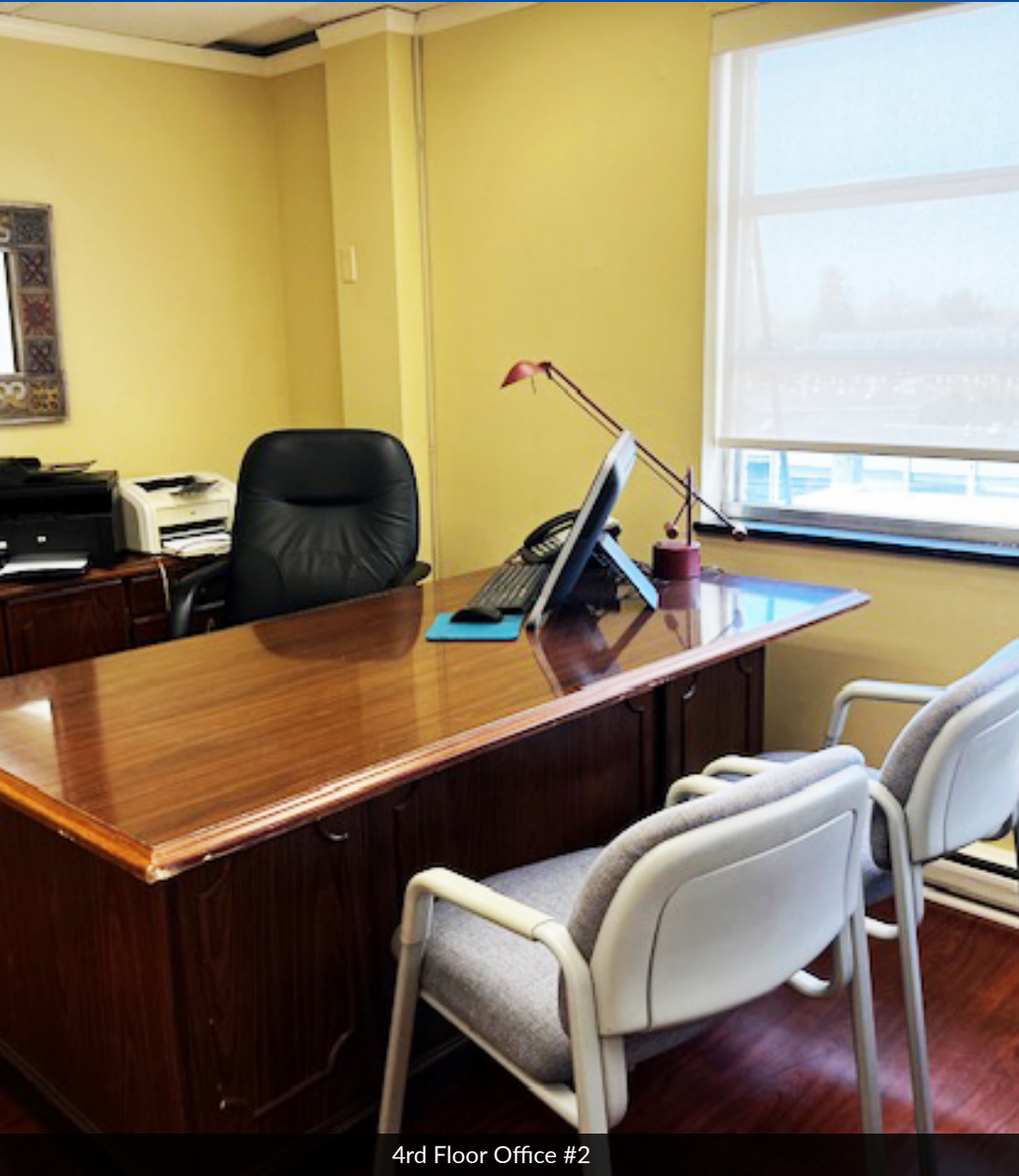
4rd Floor Office #2