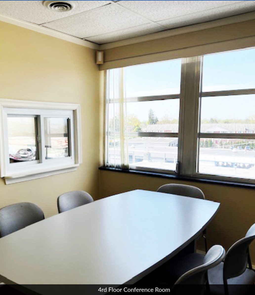
4rd Floor Conference Room