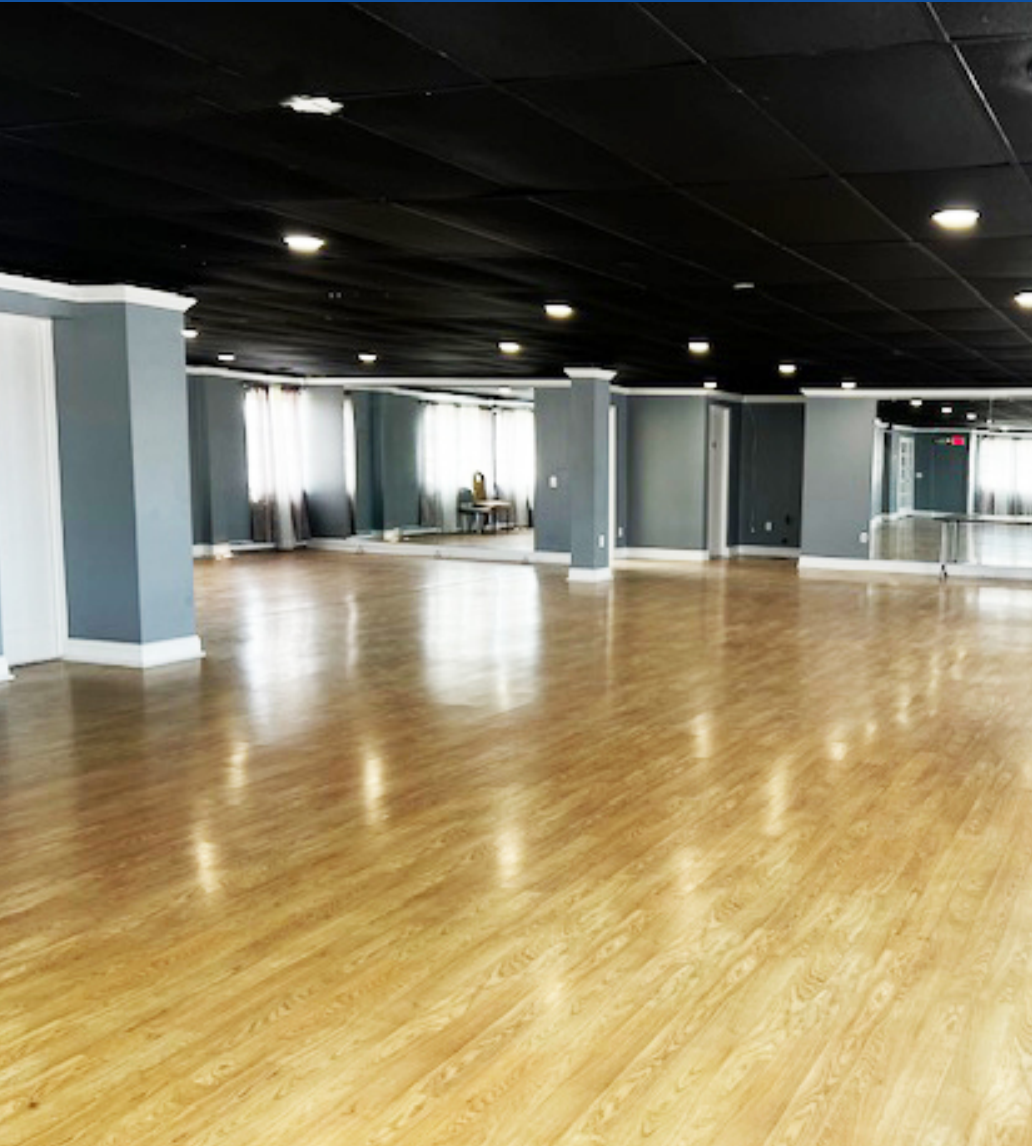
3rd Floor Dance Studio