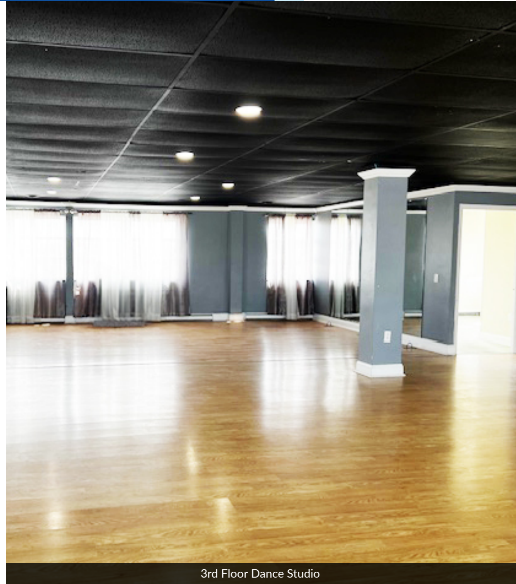
3rd Floor Dance Studio

TYLER FORESTA Sales & Leasing O: 302.414.1000 | C: 302.584.8615 tforesta@LMTCRE.com