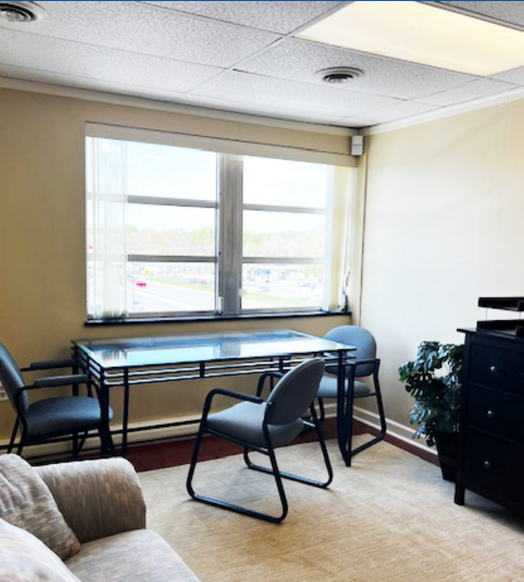
4rd Floor Open Area