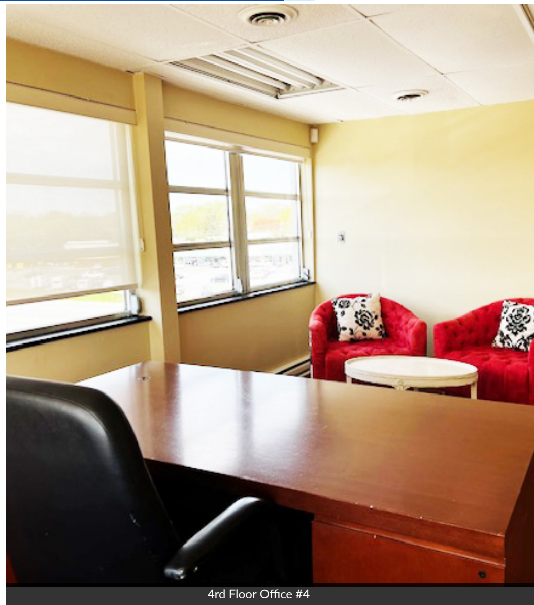
4rd Floor Office #4