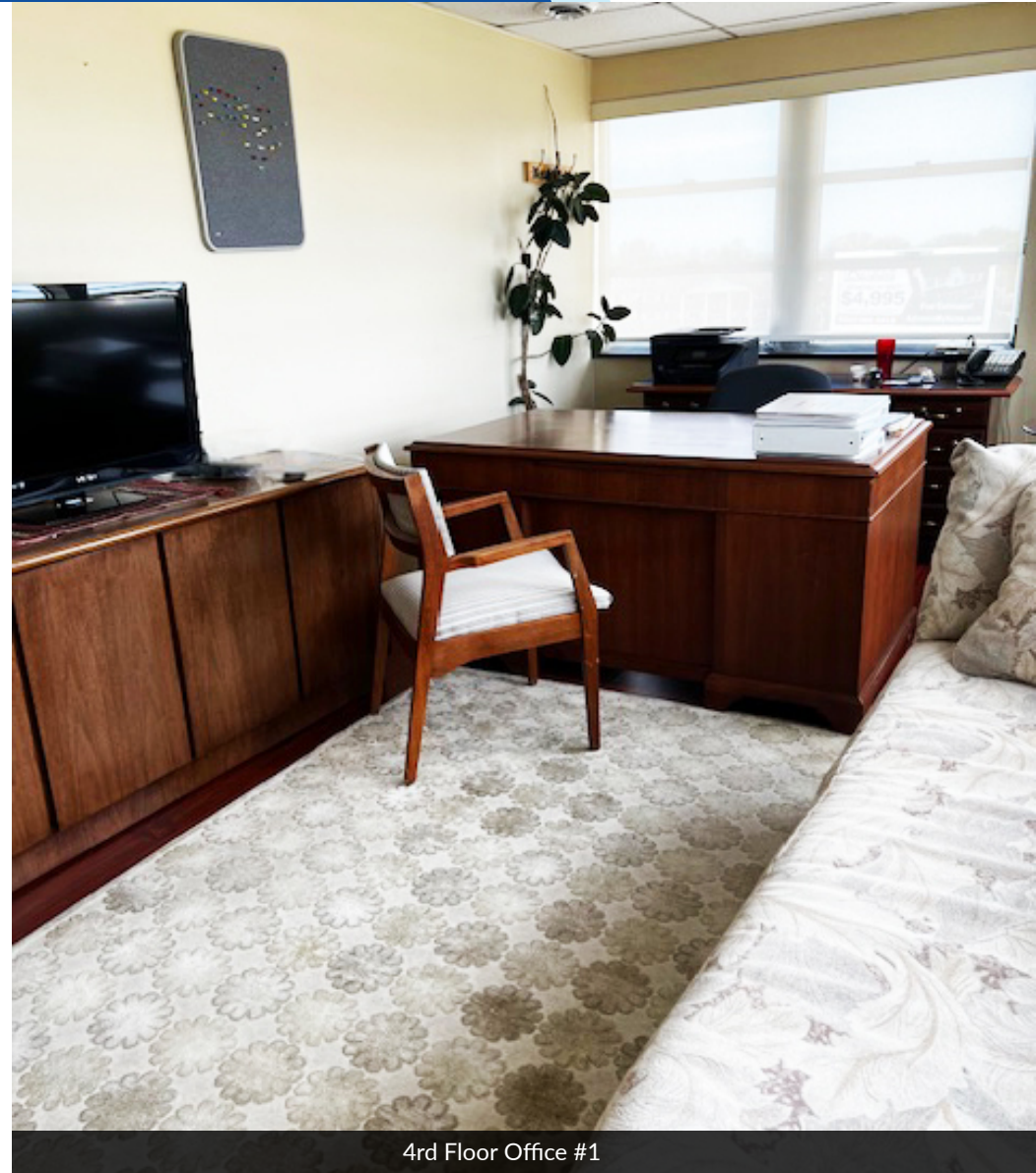
4rd Floor Office #1

TYLER FORESTA Sales & Leasing O: 302.414.1000 | C: 302.584.8615 tforesta@LMTCRE.com