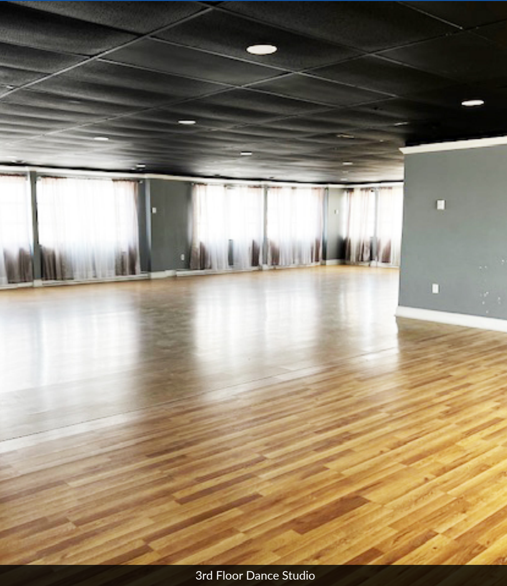
3rd Floor Dance Studio