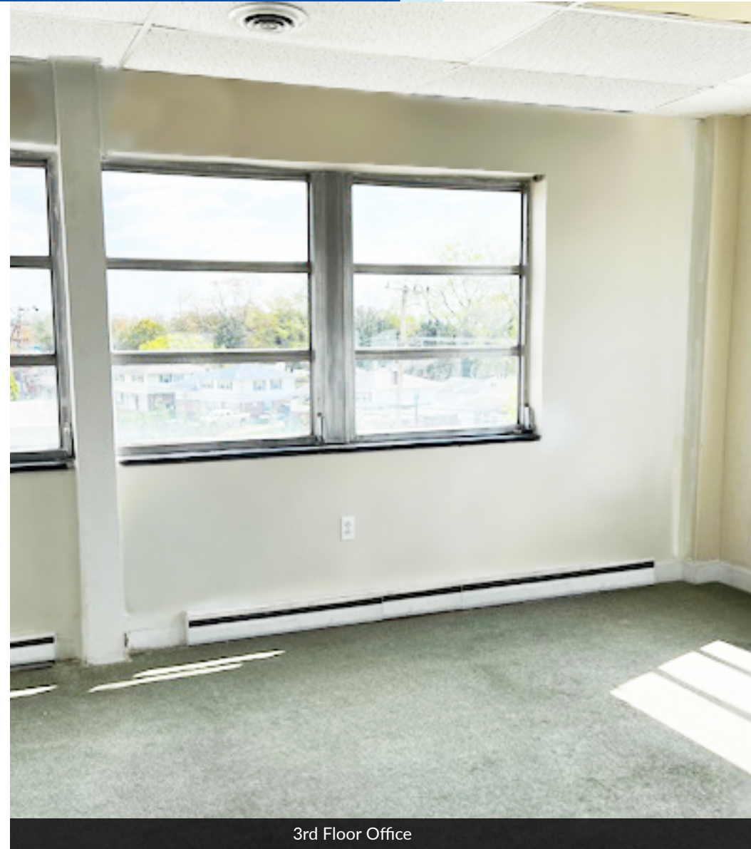
3rd Floor Office

TYLER FORESTA Sales & Leasing O: 302.414.1000 | C: 302.584.8615 tforesta@LMTCRE.com