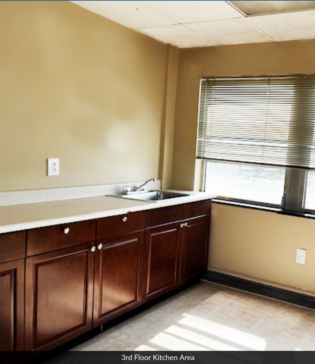
3rd Floor Kitchen Area