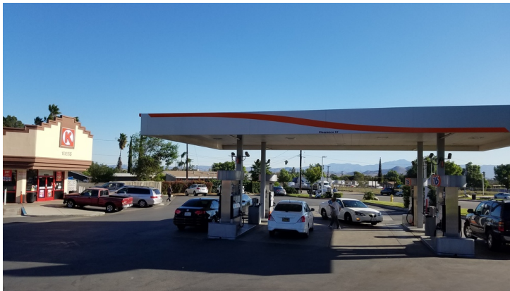
circle K - 76 fuel