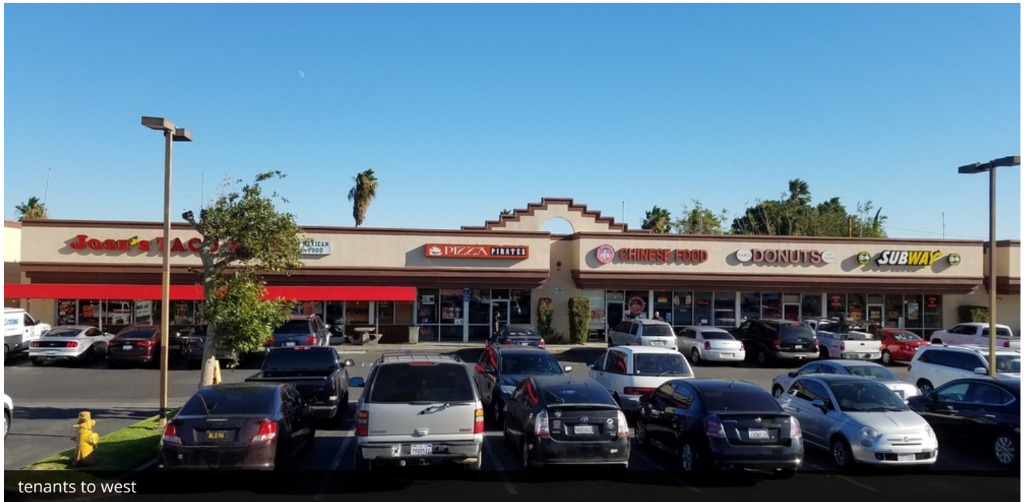
tenants to west